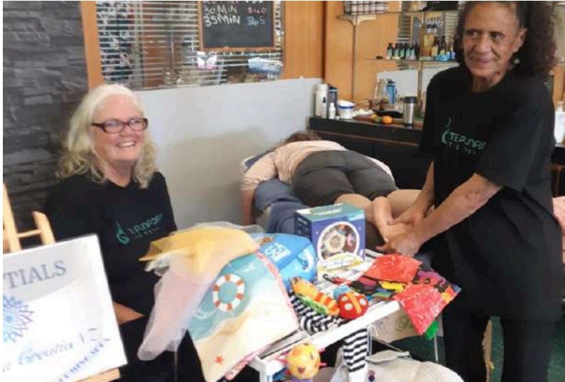
Te Puna Ora –healing our people