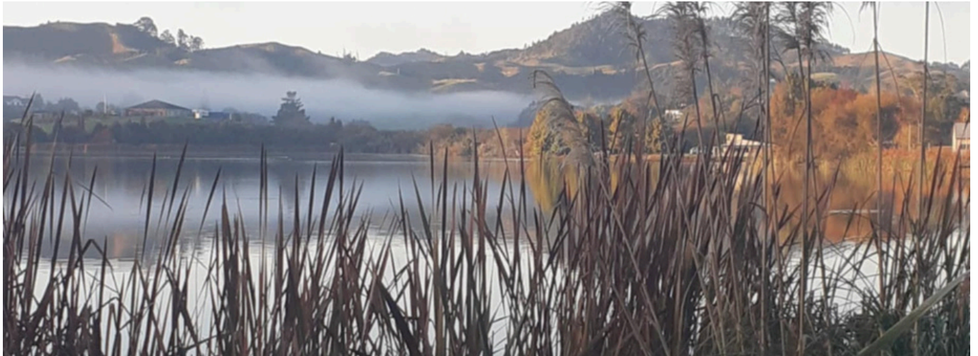
Lake Hakanoa - May 2025

In the stillness and beauty of our Taiao lies a quiet power—a source of deep rejuvenation for the hinengaro, tinana, and wairua. When life feels chaotic or overwhelming, simply pausing to observe the rhythm of Tāne Mahuta, the rise of Tamanui te ra, or the gentle rustle of Tawhirimatea can restore a sense of inner balance. Our Taiao offers mauritau where we can reconnect with ourselves, grounding us in the present moment and reminding us of life's simple, enduring cycles. In these peaceful spaces, healing unfolds not through effort, but through presence—allowing us to release stress, find clarity, and regain the resilience we need to move forward with strength and calm.