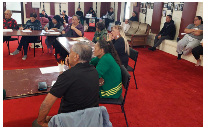
EPOA Kaumatua Wananga - May 27 at Waahi Paa - read more on page 8

Our kaumatua are living legacies—keepers of wisdom who have long drawn from the rhythms and resilience of nature to navigate the journey of life.