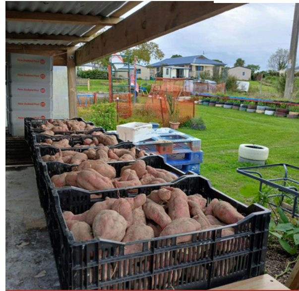
Feeding the hapori

Following the Maramataka and seasons guide our hua- whenua decisions essential for a thriving, sustainable harvest. Each crop has its own ideal growing period, and aligning planting schedules with seasonal changes ensures better yields and healthier plants. As Hotoke has approached, it's important to transition the garden with cold-endurance vegetables like Cauli, spinach, cabbage, and root crops such as carrots. Preparing the soil in late autumn with compost, using cold frames or row covers, and choosing short-day or overwintering varieties helps extend the growing season and protect crops from frost. By working with the season rather than against it, we can maintain productivity and even set the stage for an early spring hauhake.